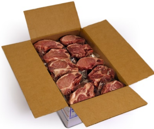
20/8 oz Organic Pork Chops, bone-in