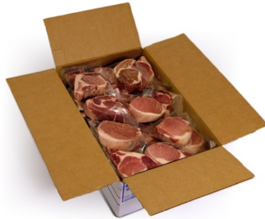
25/6 oz Organic Pork Chops, boneless