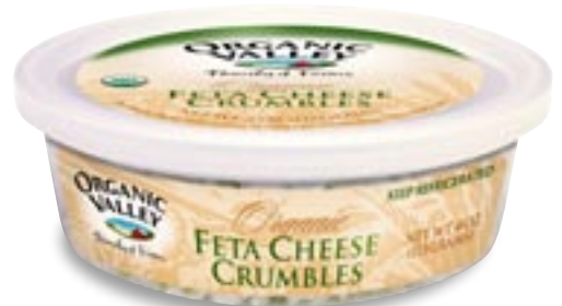
Feta Cheese Crumbles UPC# 0 93966 00212 6

Nutrition Facts: Serv. Size 1oz (28g), Servings 4, Amount per Serving: Calories 60, Fat Cal. 35, Total Fat 4 (6% DV), Sat Fat 2.5g (13% DV), Trans Fat 0g, Cholest. 10mg (3% DV), Sodium 430g (18% DV), Total Carb. 1g (0% DV), Fiber 0g (0% DV), Sugars 0g, Protein 5, Vit. A (4% DV), Vit. C (0% DV), Calcium (10% DV), Iron (0% DV). Percent Daily Values (DV) are based on a 2,000 calorie diet.