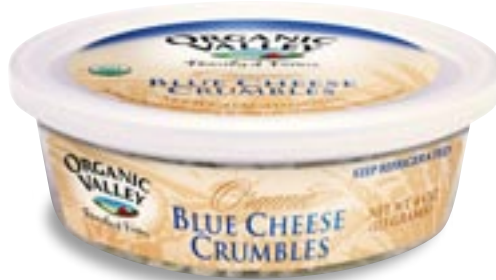
Blue Cheese Crumbles UPC# 0 93966 00211 9

12/4 oz cups Unit: 4.6875"L x 4.6875"W x 1.625"H Case: 14.313"L x 9.75"W x 4"H Wt. 3 lbs Cube .32 Pallet 13ti x 14hi